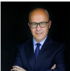
Tax advisor, partner and head of VAT services at MDDP Michalik Dłuska Dziedzic and Partners