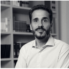
Director of Spanish VAT Services